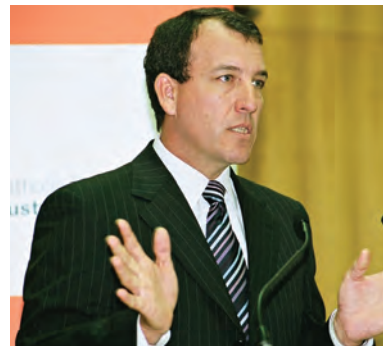
Community Services and Indigenous Affairs Minister, Mal Brough