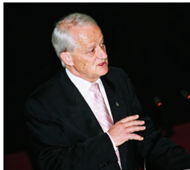
Attorney-General, Phillip Ruddock