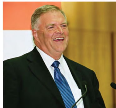
Opposition Leader, Kim Beazley