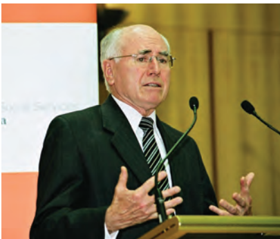
Prime Minister, John Howard