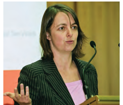
Shadow Attorney-General, Nicola Roxon