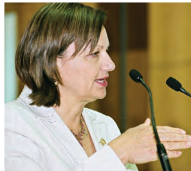
Minister for Workplace Participation, Sharman Stone