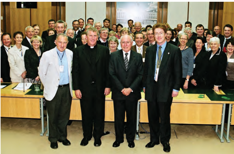
Members gathered at the 2006 National Conference, Parliament House Canberra

would continue until such time as it is no longer seen as necessary or viable. There is recognition that it will take some time for the new IRB FRSA to establish itself and for the CSSA agencies to have confidence that FRSA will be able to meet all of their support needs. The CSSA Board has committed to ensuring that during that transitional period its members delivering FRSP services will be supported to maintain quality service delivery and be able to meet the needs of disadvantaged people in their communities seeking assistance. A survey was completed by members to determine and inform the way forward for the CSSA FRSP network.