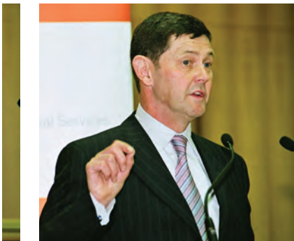
Minister for Employment and Workplace Relations, Kevin Andrews